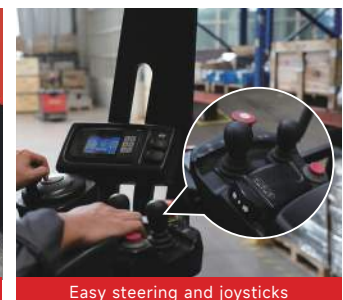
Easy steering and joysticks